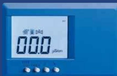
Type II Water Monitoring

Easy, quick maintenance , thanks to its system of exchangeable cartridges, using fast connections.